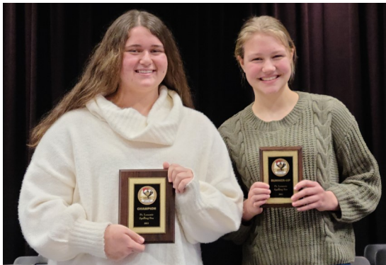
Spelling Bee Winners

Kindergarten screening will be held April 7 th at the High School Gym. Please refer to the information found in this Redskins Review.