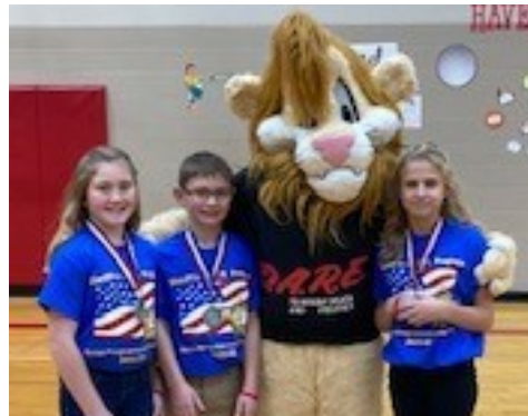
DARE Essay Winners